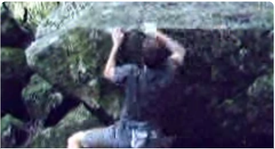
★ Dolmen 6C - image-16311776...