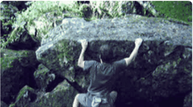
★ Dolmen 6C - image-16311775...